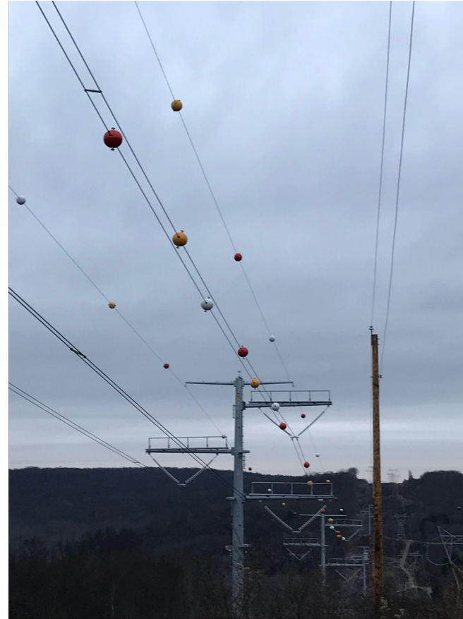
Marker Balls near Sky Acres Airport