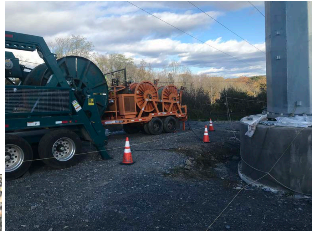
Above: Rope Pulling Machines Left: Hard Line Center: Conductor Right: Straw Line