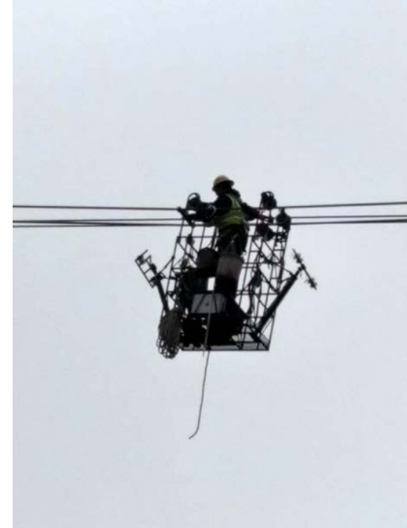
Installing spacers between conductors