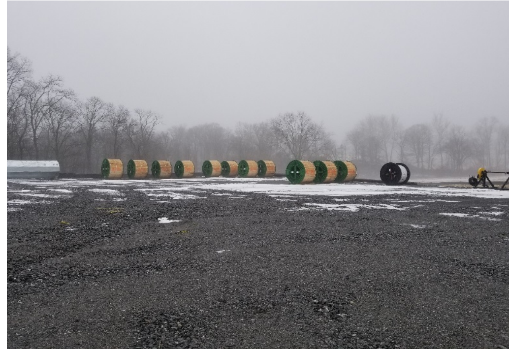
Conductor Staged for Outage