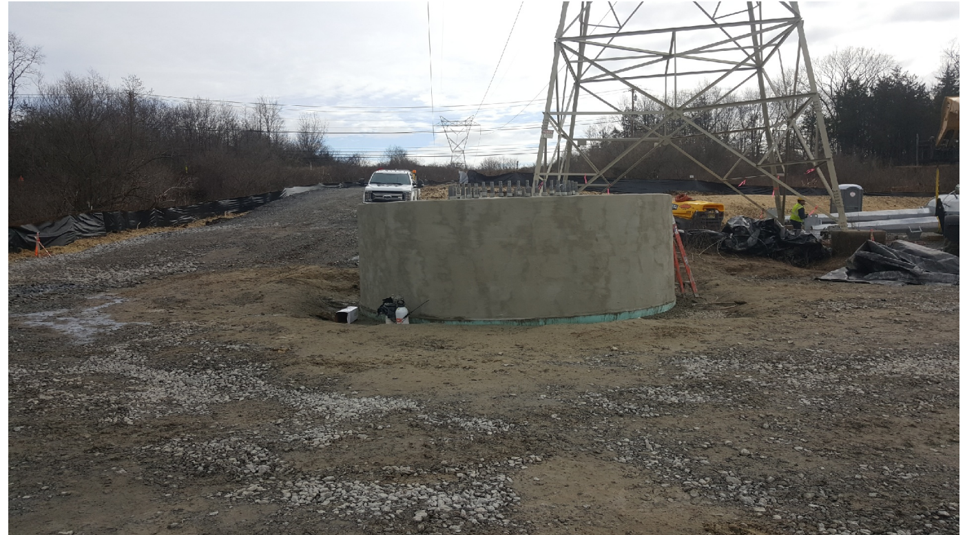
Pile Cap for New Tower