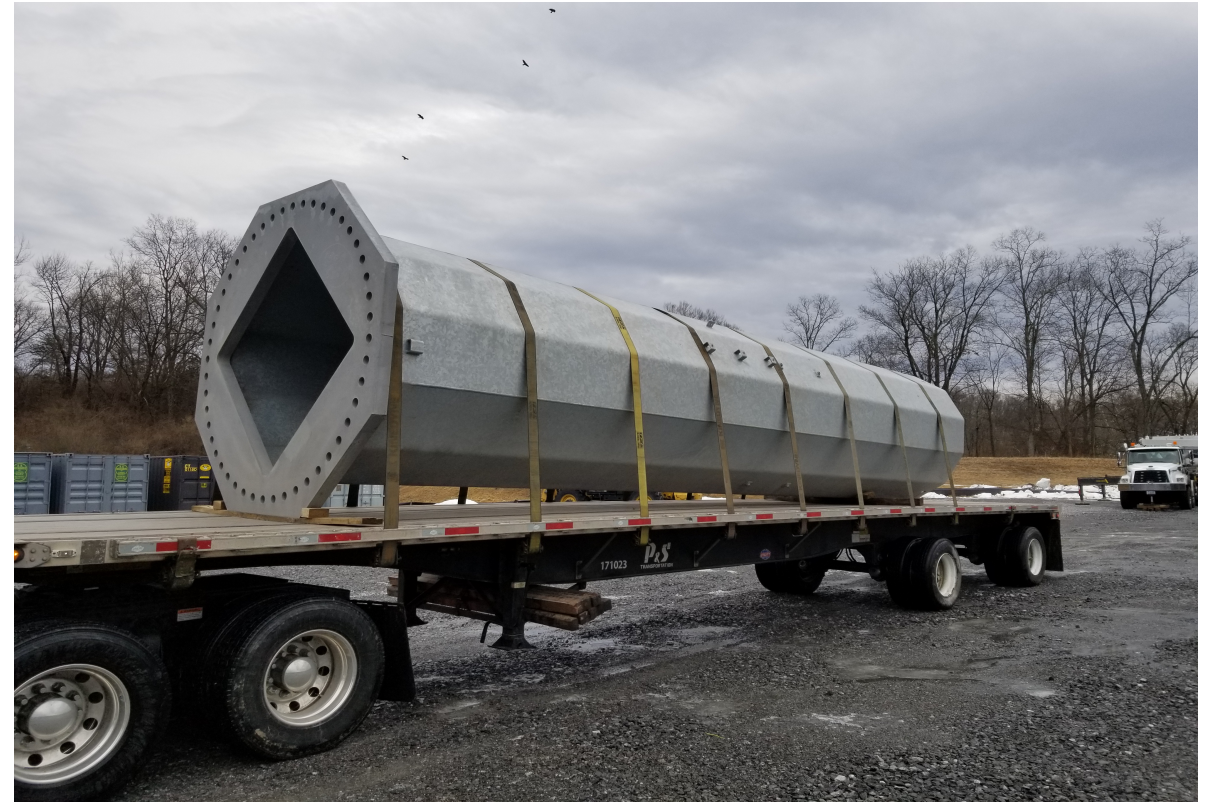
Tower Base for L60-1